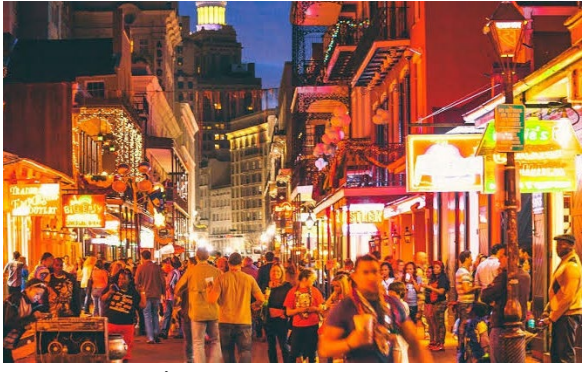
Bourbon Street Music Venues

Depart the hotel at 8.00am and travel by coach through Mississippi and into Louisiana State before entering the famous city of New Orleans on the Mississippi River. Before exiting the bus we will be sightseeing around the area and visiting a Plantation House. We continue to downtown New Orleans for a 2 night stay at the La Quinta hotel, a few blocks from The French Quarter, Bourbon Street, Royal Street, Jackson Square and the many Jazz and music saloons. The city is a fun and vibrant livemusic hub with spicy Cajun cuisine reflecting its well-known history of French, African and American influences.