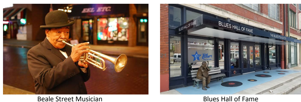
Beale Street Musician

Continue the sightseeing and visits and some time to relax and walk Beale street bars.