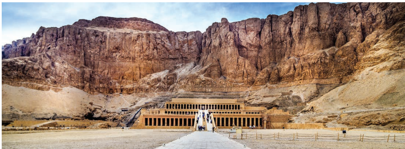
Monument of Queen Hatshepsut, Luxor

Relax on one of the Sun Decks and catch a glimpse of daily life along the banks of the Nile as you cruise to Dendera. Once in Dendera, you will have a chance to marvel at the vibrant colours of the hieroglyphics adorning the roof of the Hathor's Temple during your included visit. Return to Luxor and tour the temple complex of Luxor straddling the banks of the Nile. This evening,