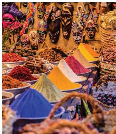
Khan-El-Khalili market, Cairo

Upon arrival at Brisbane airport, you will be transferred by coach back to the South Burnett area.