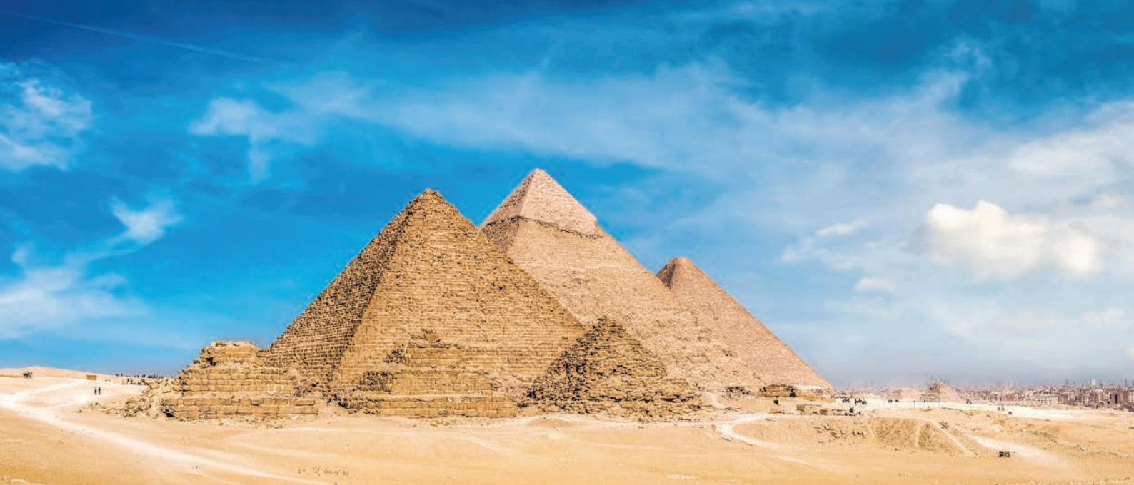
Great Pyramids of Giza, Egypt