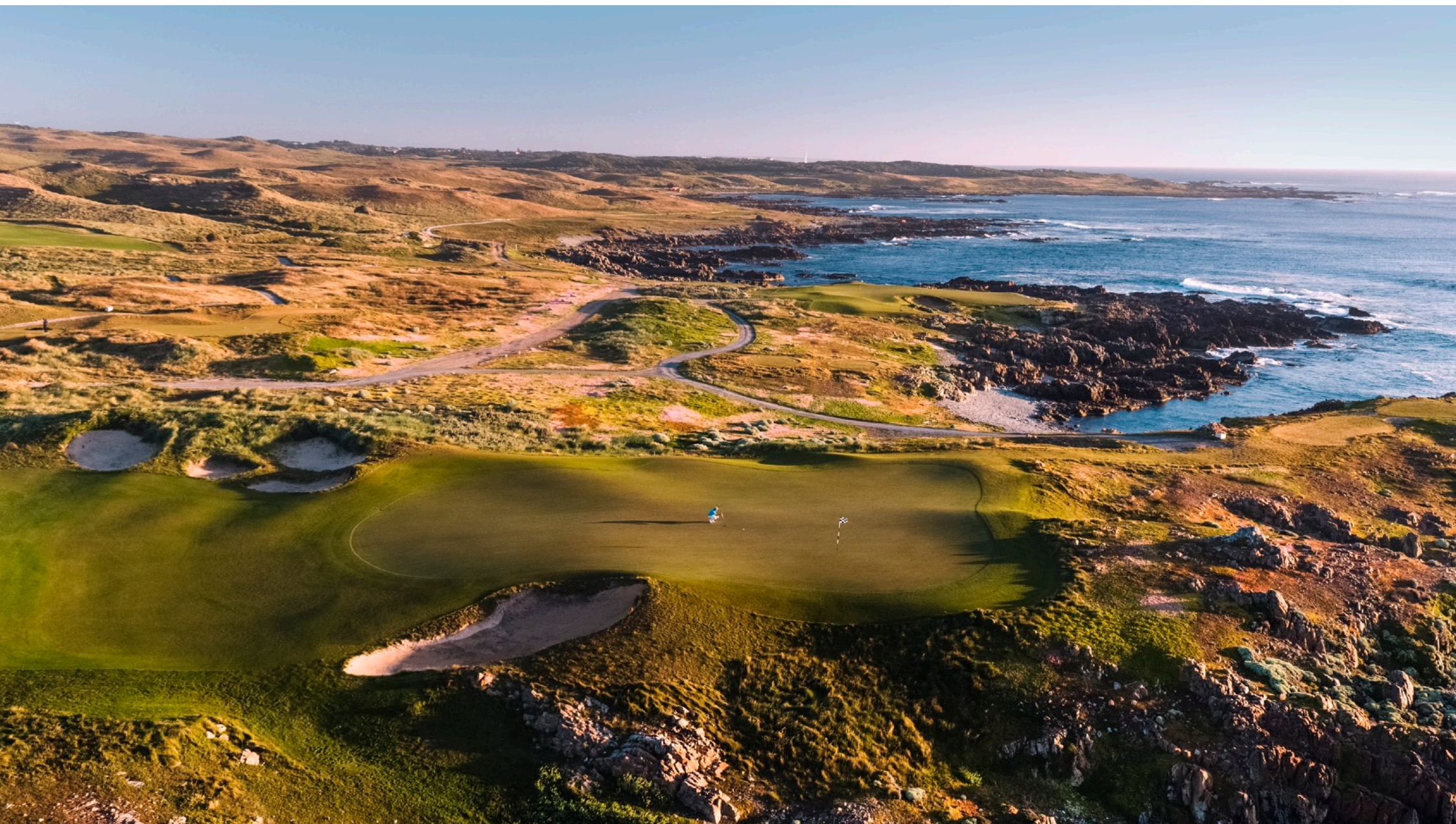
Barnbougles & King Island - 5 days