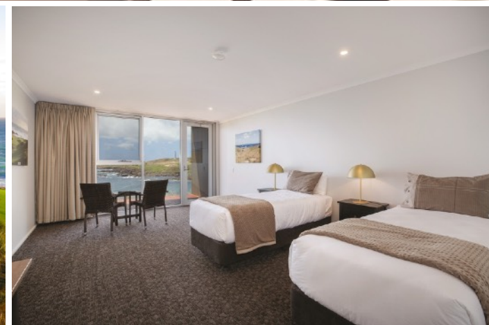
Clockwise from top: The ultimate in on-course accommodation and dining, Lost Farm; Air Adventure's Outback Jet; Play the exciting new Cape Wickham Course on King Island; Ocean View Suite, The Lost Farm