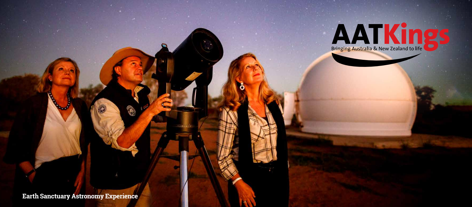
Earth Sanctuary Astronomy Experience